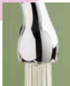
Fine spray flow