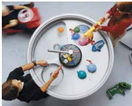
Three individual bowls incorporated into the one unit.