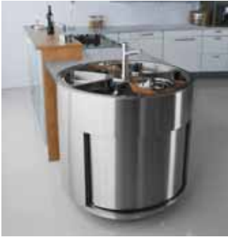
Peninsula - Circular or 'D' Shape

The Waterstation is a completely revolutionary concept for the kitchen. It has four types of application: you can use it as a island unit or it can be incorporated within the kitchen units. If you are installing it within units state if it is in a corner, peninsula or a straight run.