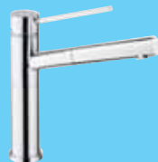
Ref. 72070904 360 degree X-Trend Pull-Out tap in brushed steel £488