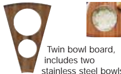
Twin bowl board, includes two stainless steel bowls.

All of the following accessories are included in the price of the Waterstation.