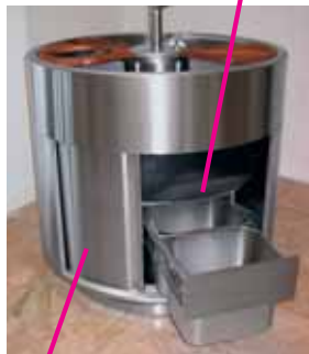
Sliding door within base